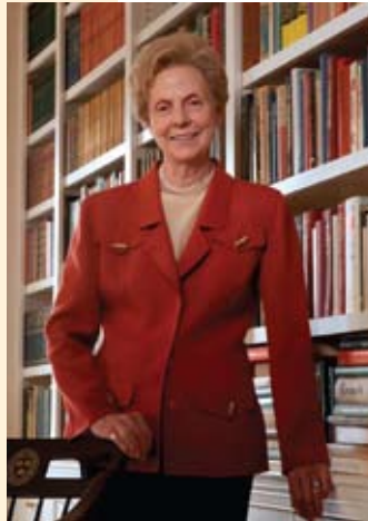
Jill Ker Conway

A woman renowned for her gifts with words, Jill Ker Conway recently used the written word to give a gift that will have a lasting impact on the Institute for Advanced Catholic Studies. Mrs. Conway elected to allocate a portion of her estate to the Institute, taking advantage of the opportunity to make a planned gift tailored to her philanthropic goals and financial needs.