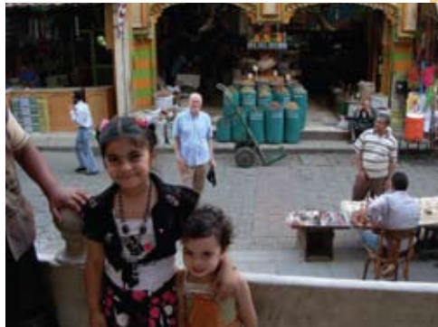
In Cairo, section of Old Town (June 26, 2009).